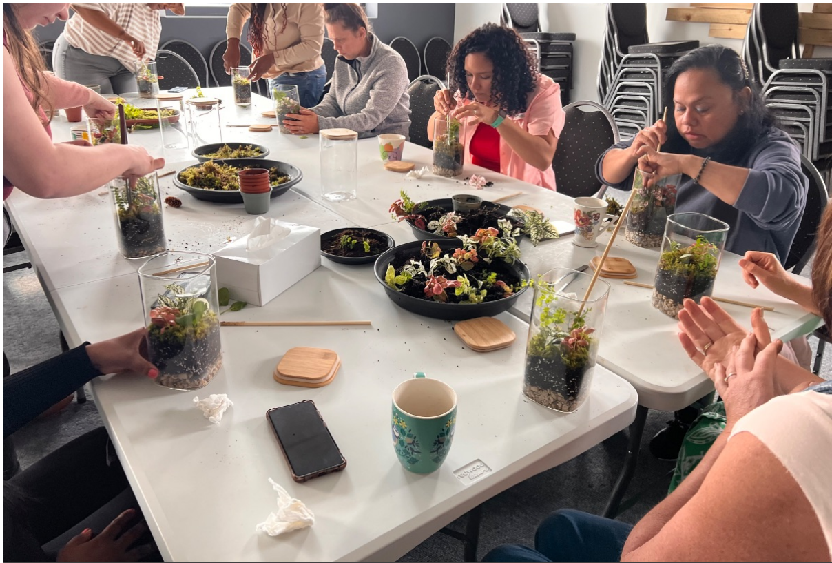
Ladies' terrarium event with 12 wonderful women in attendance.