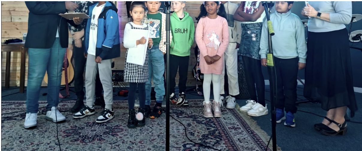
The kids' club is performing a skit titled "Breaking News."