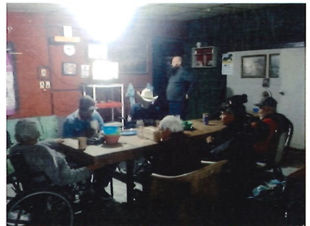
Listening to Panchos Gospel music before Bible study