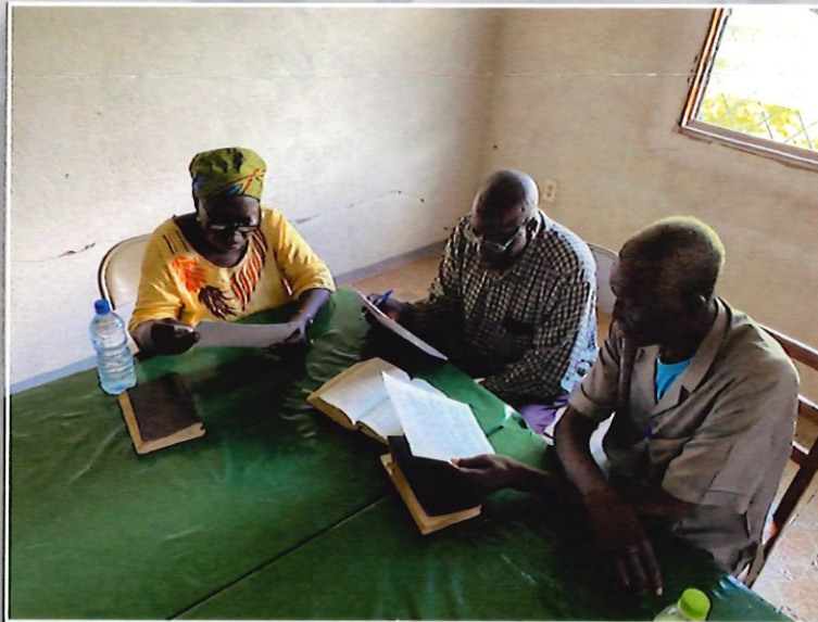
Above is a group of Day Christians practicing the "read-through" step last December. Once the Day Bible translation has been approved by Bibles International, the Day team will organize reading groups to read through the Day translation one final time.

we need to decide whether they should be combined or not. Please pray we can zero these lists out.