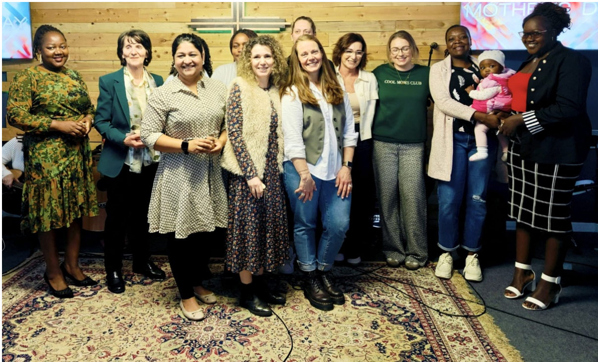
Many of the mothers who are a part of TBF