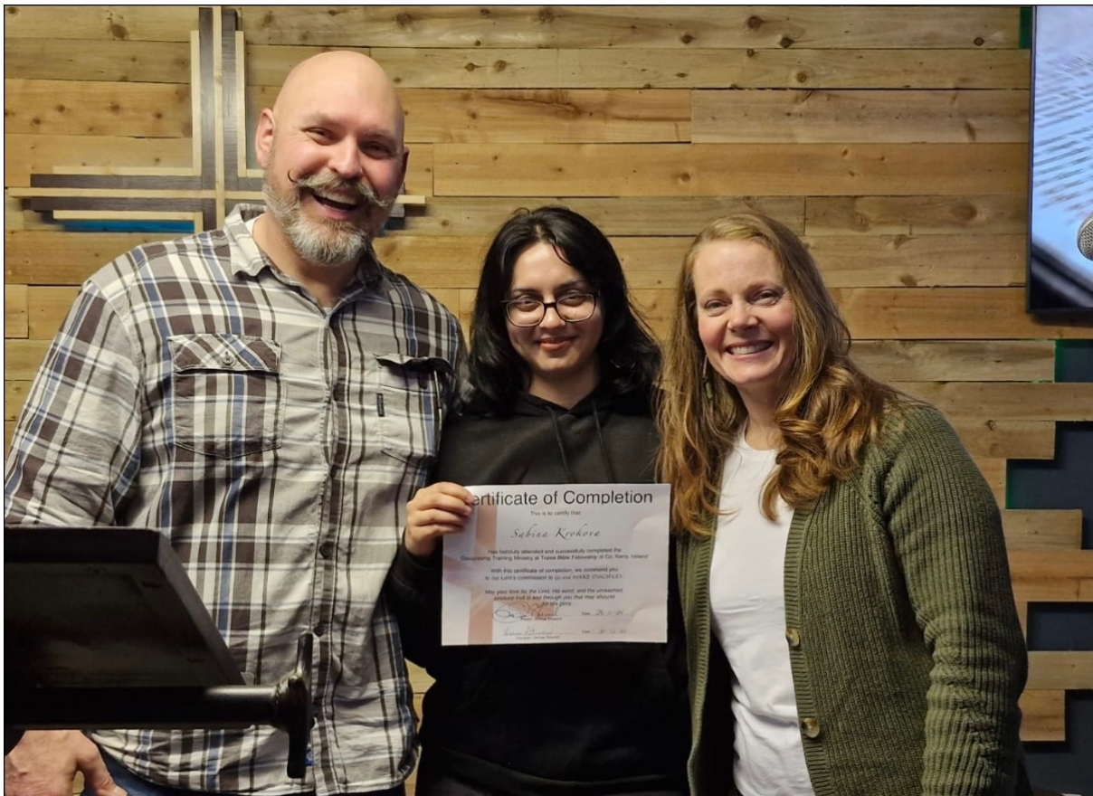
Denise disciple being recognised for completing One-on-one discipleship