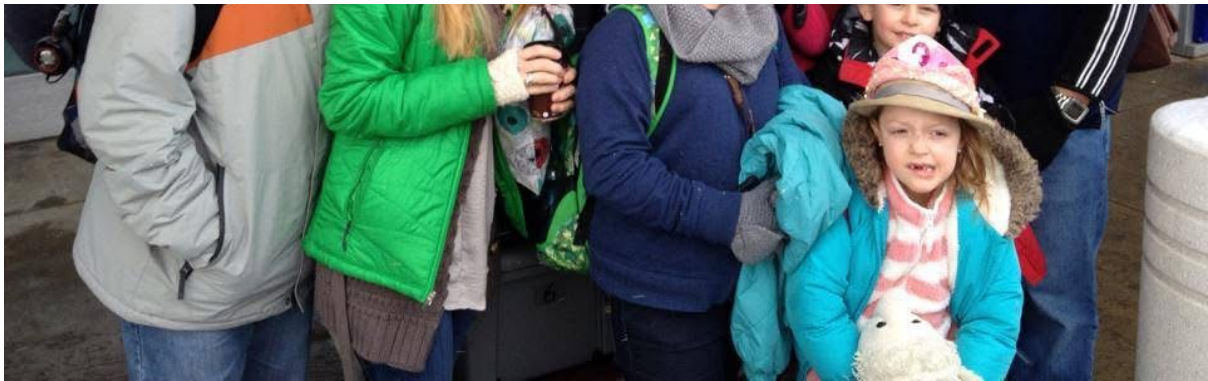
A snapshot right before we left for Ireland in 2014 from Cleveland Airport.