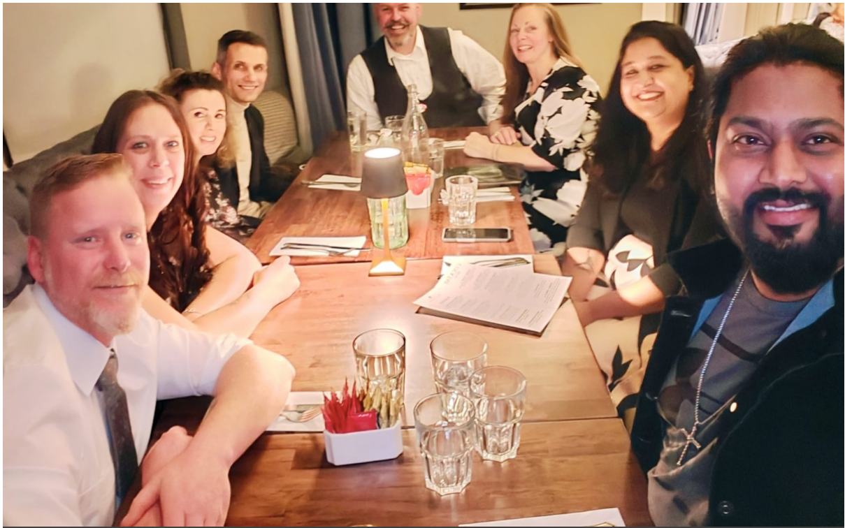
Leadership Recognition dinner