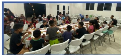
Feeding kids on Christmas Day.