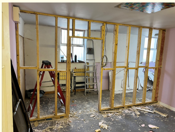
Renovation at church for kids club