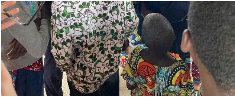
Church members learning how to use their audio Bibles.